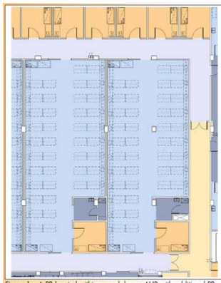
Figure 1c. A PR located within a much larger AHR with additional PR

rooms usually hold only a single rack. A 600/700 cage room with an associated PR is more desirable for operational efficiencies. Distributed in 5-7 AHRs, the same 600 cages produce more custodial duties. In Figure 1c, a small 120 sq. ft. PR is located within a large 2220 sq. ft. AHR with additional PRs, each at 120 sq. ft., accessed off an adjacent main hallway. There are 20 racks within the large room, providing ~2400 cages. 2