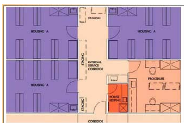
Figure 1a. A PR with dedicated access from several AHR.

Figures 1a, 1b & 1c provide examples of possible design options for the AHRs with associated procedure space. 2 Figure 1a shows a suite in which a PR has dedicated access from several AHRs, accommodates up