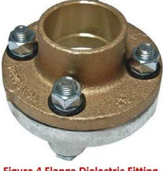
Figure 4 Flange Dielectric Fitting

It's important to select the most appropriate dielectric fitting based on the ferrous and non-ferrous metals and the electrolyte (fluid) or atmosphere exposure. Piping location, vibration, and movement should also be considered, especially for the installation of dielectric fittings on continuous sections of the piping. Welding of piping should be performed prior to installing dielectric fittings, as heat can damage the isolating component or sleeve of the fitting.